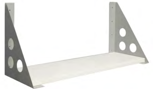
CBC SHELF + SCSHELF BRACKET