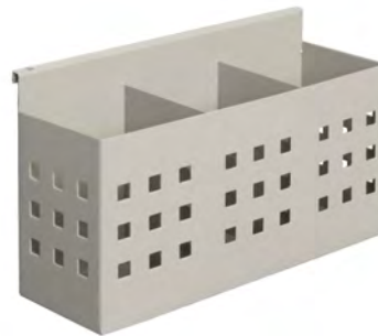
SCPEN HOLDER 3