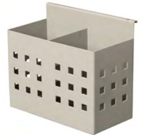
SCPEN HOLDER 2